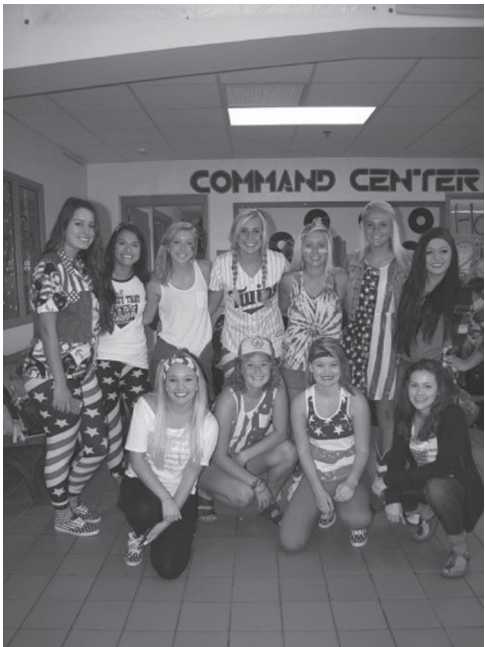
The Class of 2015 showing off their patriotism for America Day.