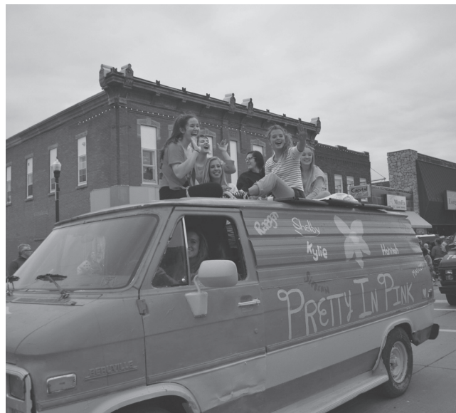
Designed by a group of junior girls, the Pretty in Pink govmobile shown off to the parade goers.