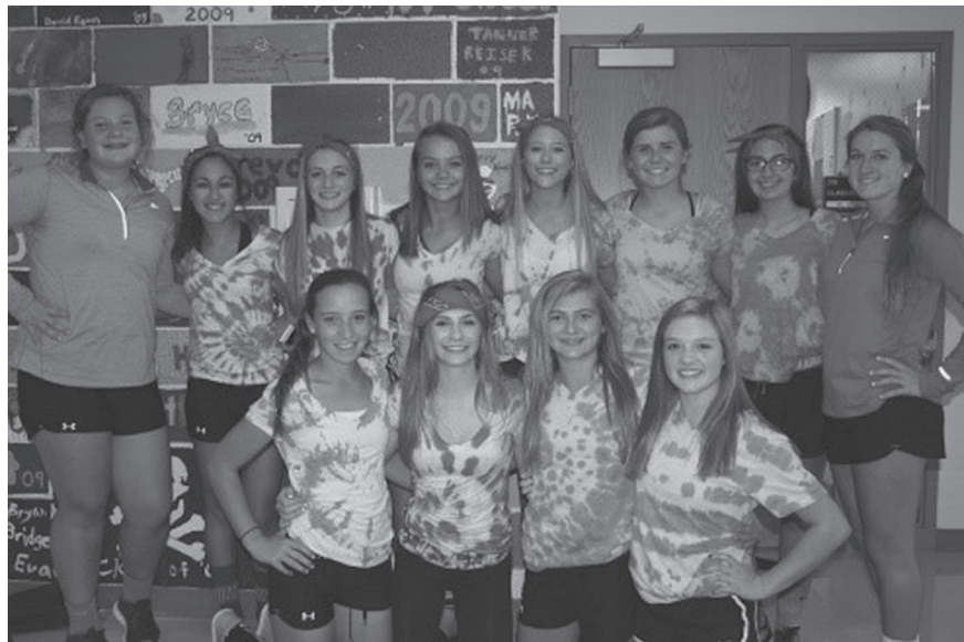
Freshmen girls pose for color day on Monday of Homecoming week. Freshmen wore pink; sophomores wore yellow; juniors wore red; seniors wore black; staff wore blue.