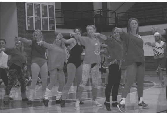
Senior girls (and boys in the background) perform their 80s dance routine during the Olympics Friday afternoon.